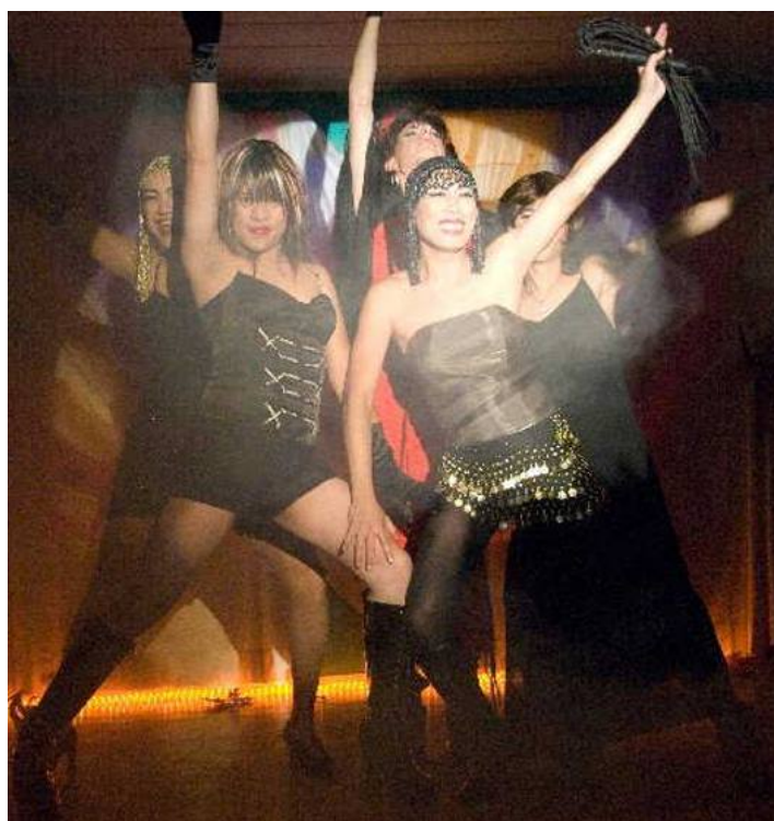
The A/PGF Divas

A/PGF's annual Halloween party, held on Saturday, October 25th was AMAZING!!! Most of our guests were in awesome costumes that ranged from cute to gruesome and flirtatious to scandalous! Fun and naughtiness were plentiful throughout the evening.